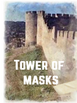
TOWER OF MASKS