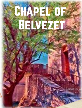
CHAPEL OF BELVEZET

I like to visit the Fort first to get a sense of height. The walkway is a must. I also love the view from the Chapelle de Belvezet , which allows you to contemplate 4 views in a row (the fortifications of the Fort, the Philippe-Bel Tower, the green belt and the City of the Popes).